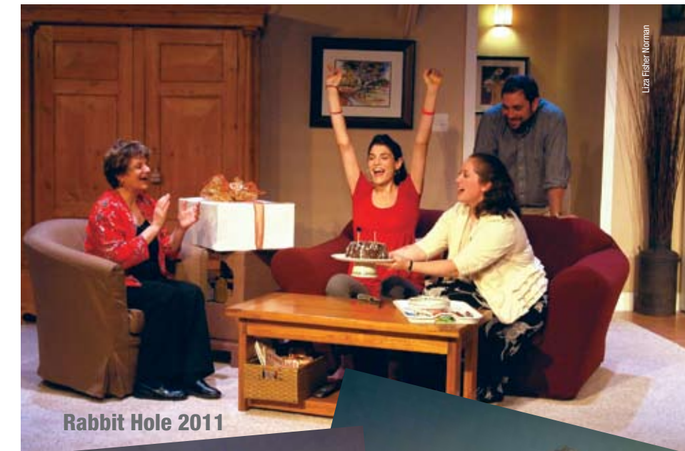
Rabbit Hole 2011

Audience members can participate in the dialogue by asking questions and offering opinions, or can simply sit back and listen. Come join us after our Wednesday evening performances for some entertaining and enlightening conversation.